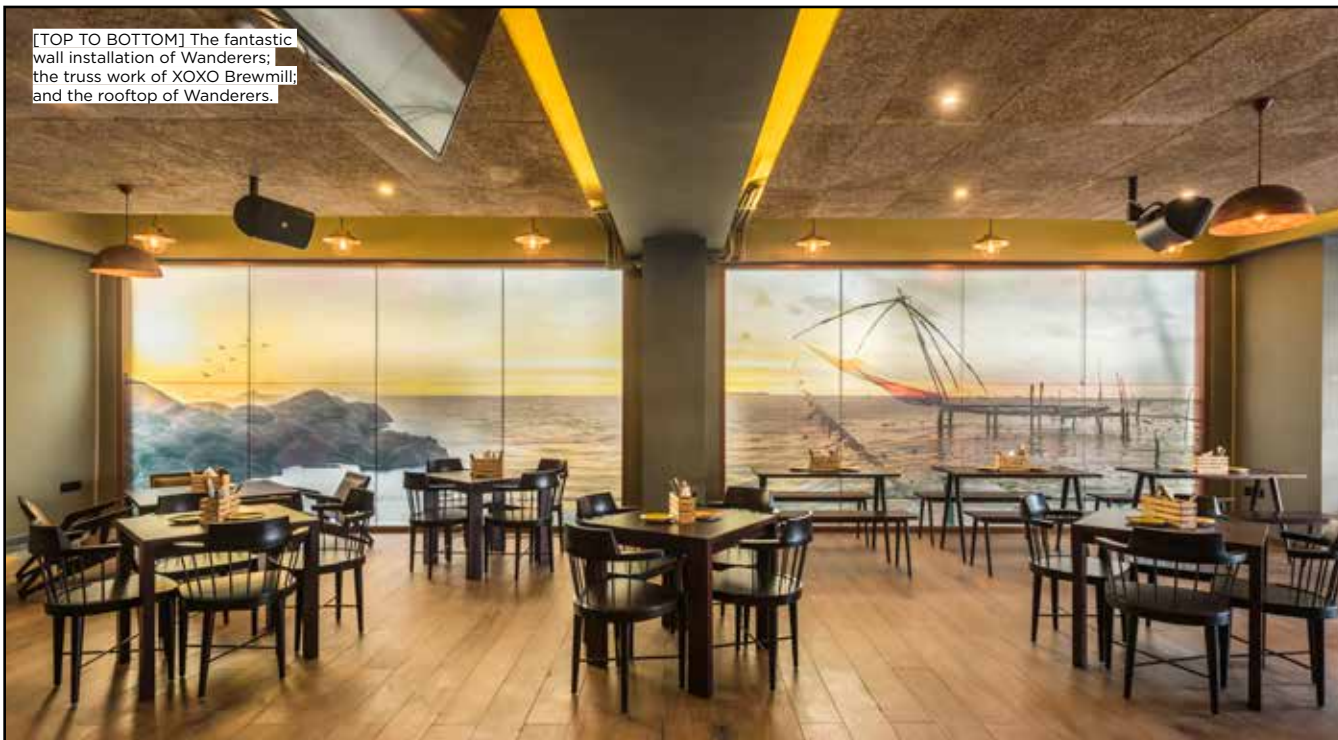
[TOP TO BOTTOM] The fantastic wall installation of Wanderers; the truss work of XOXO Brewmill; and the rooftop of Wanderers.