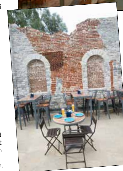
[CLOCKWISE FROM TOP] The interiors of XOOX Brewmill; the amphitheatre of Big Brewski Brewing Company; rooftop of Bangalore Brew Works and Big Brewski Brewing Company.